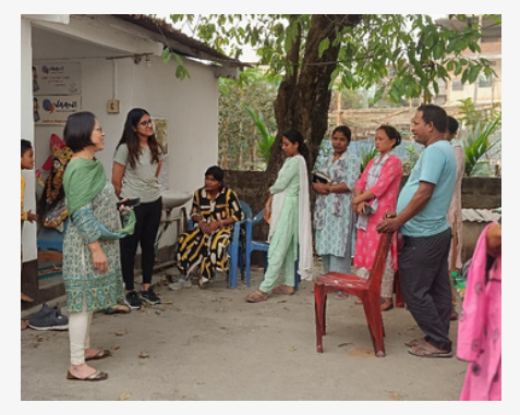
Thomson Reuters @ Assam

Our esteemed donors visited the field to witness our impact firsthand at our centers and interacted with stakeholders to gain deeper insights into our work. Their involvement helps strengthen our mission of creating an inclusive learning environment for children with hearing impairment.