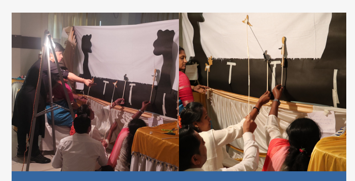
Backend of the shadow Puppetry

During the session, our teachers were explored the fundamentals of puppet-making, character development, and storytelling.