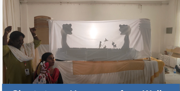
Short story: Venu goes for a Walk

Teachers discovered how enganging & effective shadow puppetry can be used as a powerful tool to enhance classroom interaction and make lessons more accessible for deaf children.